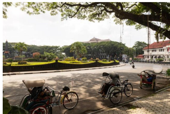
Leafy Tugu Park in Malang

Eco-tourism is the economic focus in the fourth growth area: the ‘Bromo-Tengger-Smeru (named after two of the principal volcanoes in the region) or BTS as it is called. Malang, home to the now infamous Kanjuruhan football stadium, and the horticulture-centred hill station of Batu, form the main urban hubs in this region. Tourism and the dairy industry – a large investment by multinational, Nestle, is located near Malang - are the flagship sectors.