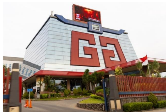
Headquarters of PT Gudang Garam in Kediri

Even in this laggard region there are success stories. Near the border with Central Java, Magetan, located on the fertile slopes of Mt Lawu, has long been a centre for horticulture. In recent years, the Regency has developed niche home industries in leather shoe manufacturing and conical hats for, amazingly, farm workers in China. In the southern city of Blitar, egg production is a growing industry spurred by an agglomeration of family companies that have been able to control egg prices throughout Java and in Jakarta. On the province's south-west coast, Pacitan, the birthplace of former Indonesian President Yudhoyono, is endeavouring to promote eco-tourism based on its abundance of natural limestone caves and beaches. However, like other towns along the south coast of East Java, the need for long supply chains as a result of a deeply indented and rugged coastline and a lack of direct east-west road and rail connections is retarding further growth in the region.